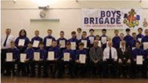
Presentation Day in Renfrew North Church Sunday 2nd June Guest of Honour: